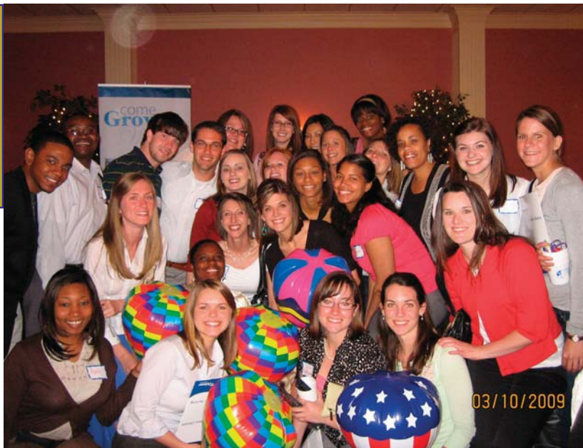
LSUHSC Students at a NODNAA Spring Event