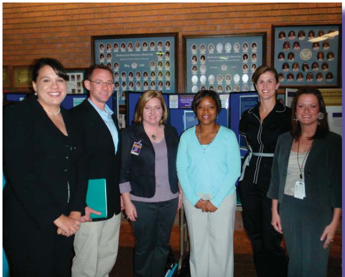
LSUHSC MNNA Students and their Poster Presentation